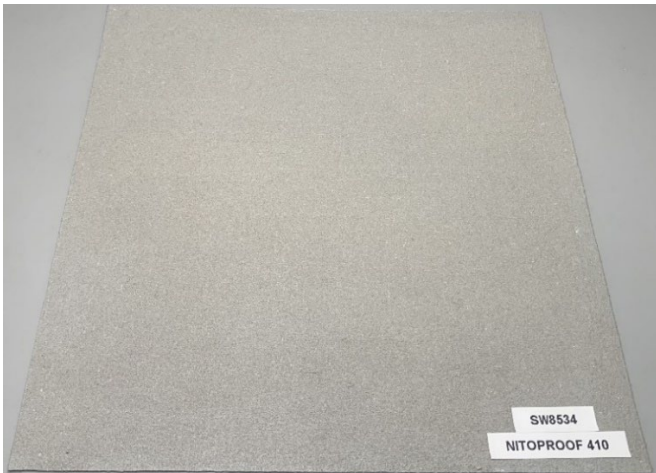
Figure 1 Top face of Nitoproof 410 for SW8534(1st revalidation)

The supplied specimen for assessment is shown below in Figures 1 and 2.