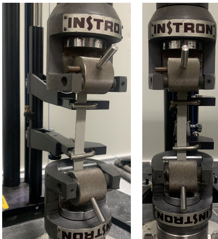
Figure 3 Images of test sample performing durability load / elongation test

The performance criteria set out in AS 4654.1:2012, Table A4 specifies a comparison of the immersed test samples to the unconditioned (control) test samples shall be greater than 25% elongation at break.